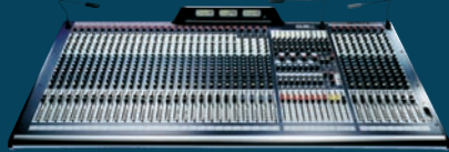
MH Series Dual-Mode large format Live Consoles