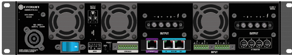
4|2400N model shown