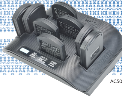
AC50 Battery Charger